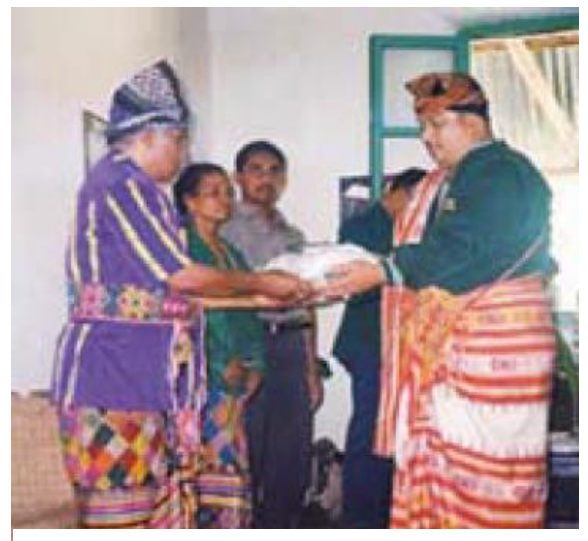
The payment of belis is an important prerequisite for the legitimization of the marriage.

Belis has several functions for both the groom and bride, among others: (1) as a means to strengthen relationship between fam /family, (2) a means of deciding the marriage validity, (3) as a social marker that the female had been out of the family /fam origin, (4) a means to enhance the degree or name of the male's family. The positive impact of giving belis as follows;