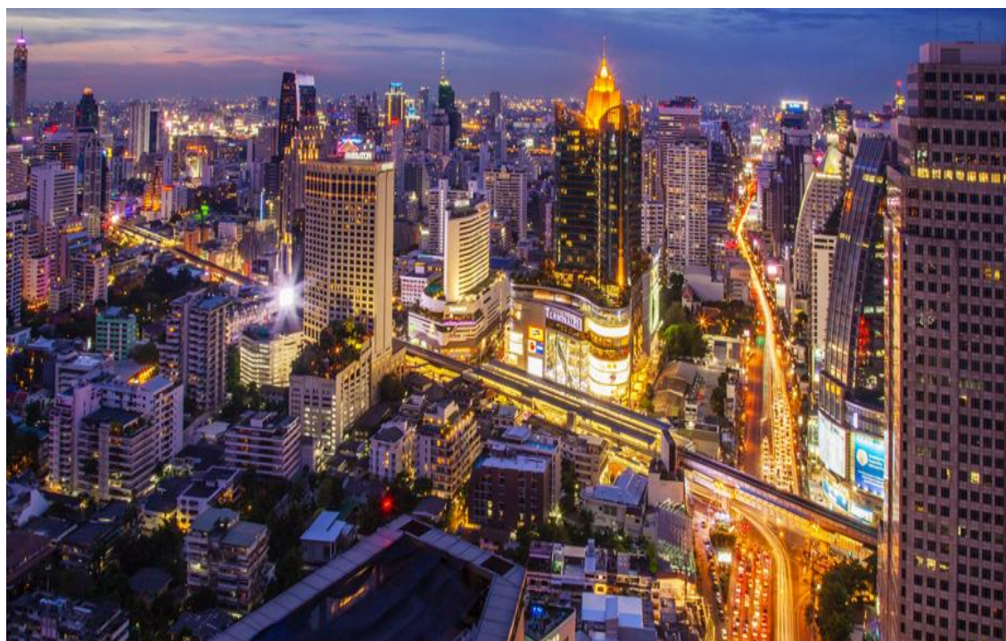
Figure1: Bangkok's skyline-it reflects the booming urbanization process of Bangkok.

Thompson (1967: 532) states that apart from the Wat(Buddhist temples), there is nothing of a settled character about Siamese towns. All the development of agriculture and trade has not made real towns out of the old settlements, which were almost always both administration centers and market places. She also reveals that to this day the only real city was Bangkok. It is found that during the Sukothai period all the settlements including Sukothai, the capital city, were characterized as rural areas which their people engaged in agriculture. During the Ayuttaya period, there was only one city which began to develop urbanization gradually and that was Ayuttaya, the capital city at that time. Bangkok is located on the left bank of the Chaopraya River. It was