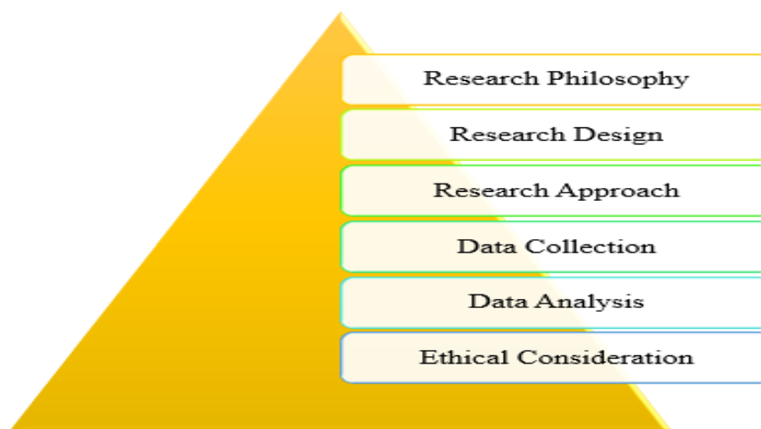
Fig1: Research Methodology Structur

The methodology of this study is depicted in Figure 1. The figure illustrates a systematic progression of research philosophy, research design, research approach, data collection, and analysis. The ethical considerations of this study have been expounded upon.